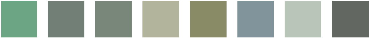
6021 PALE GREEN