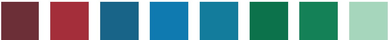
3009 OXIDE RED